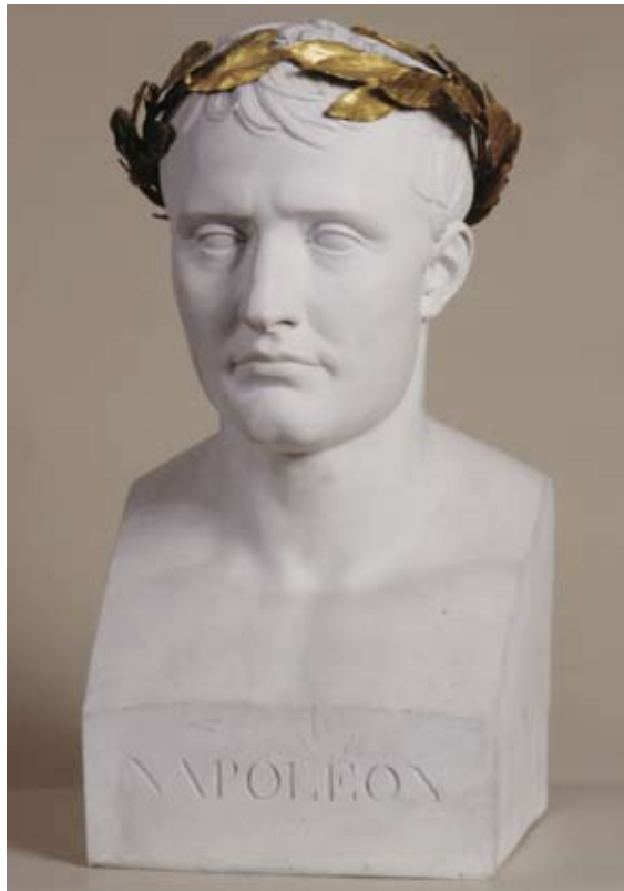
Portrait of Napoléon