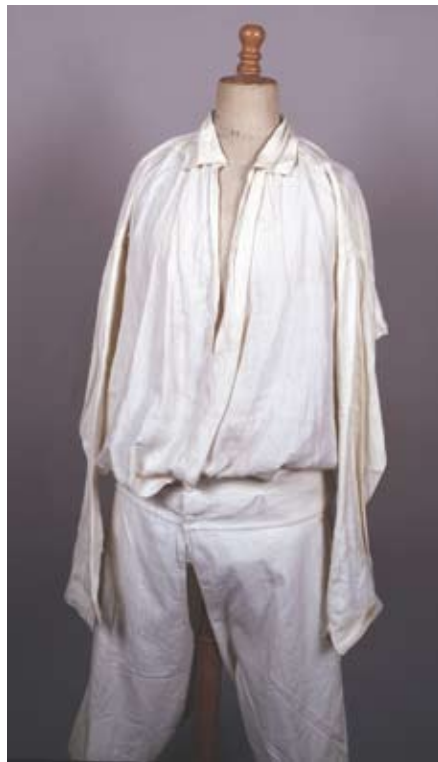
Napoléon's monogrammed shirt and longjohns worn on St. Helena