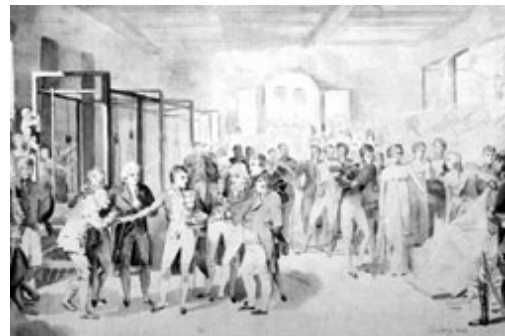
Bonaparte Visiting the Silk Manufacturers of Rouen , Jean-Baptiste Isabey, 1802, India ink and sepia on paper.